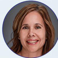
Kim McLeod-Estes Duke Health Center, USA